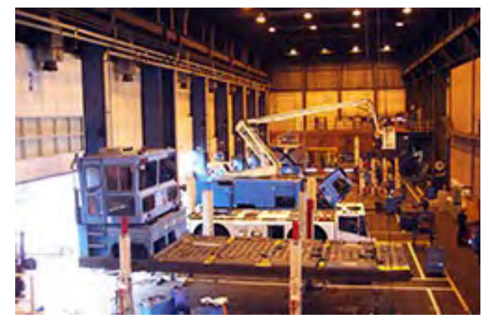
KLM manages and maintains thousands of pieces of equipment, ranging from simple baggage dollies to massive main-deck-loaders