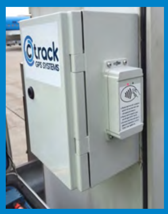
Ctrack RFID Reader

Based on the data feed, a back office application such as a dynamic planning solution or ERP system is fed with the data in order to create invoices or improve outstanding work. With this, KES was given a fully automated billing engine that delivers undisputable invoices to its clients. Besides a measurable administrative improvement, this resulted in a direct reduction of administrative hours and higher customer satisfaction.