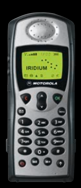
9505 Portable Phone Satellite antenna not displayed.

Confidence in your lifeline-Combine Motorola's durability with the Iridium services to communicate from places you never dreamed possible.