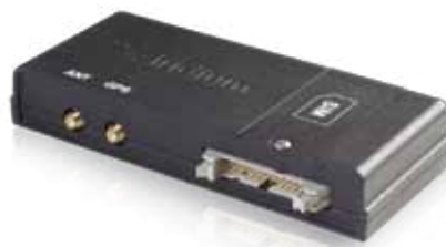
Iridium 9522B voice and data communications