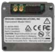
Iridium 9602 SBD data modem

Deployed in mission critical applications today, Iridium devices are thoroughly field-tested under some of the harshest environments known to man – from the frozen Arctic to equatorial deserts, and from high-altitude aircraft to robotic scientific gliders that submerge deep beneath the sea.