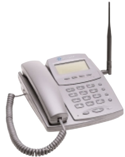
Phoncell SX5D GSM Fixed Wireless Phone