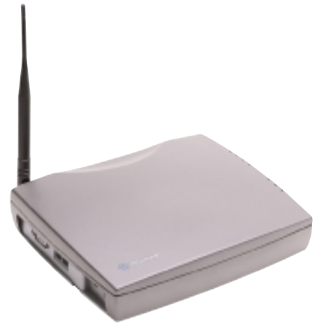
Phonocell SX5e GSM Fixed Wireless PBX Terminal